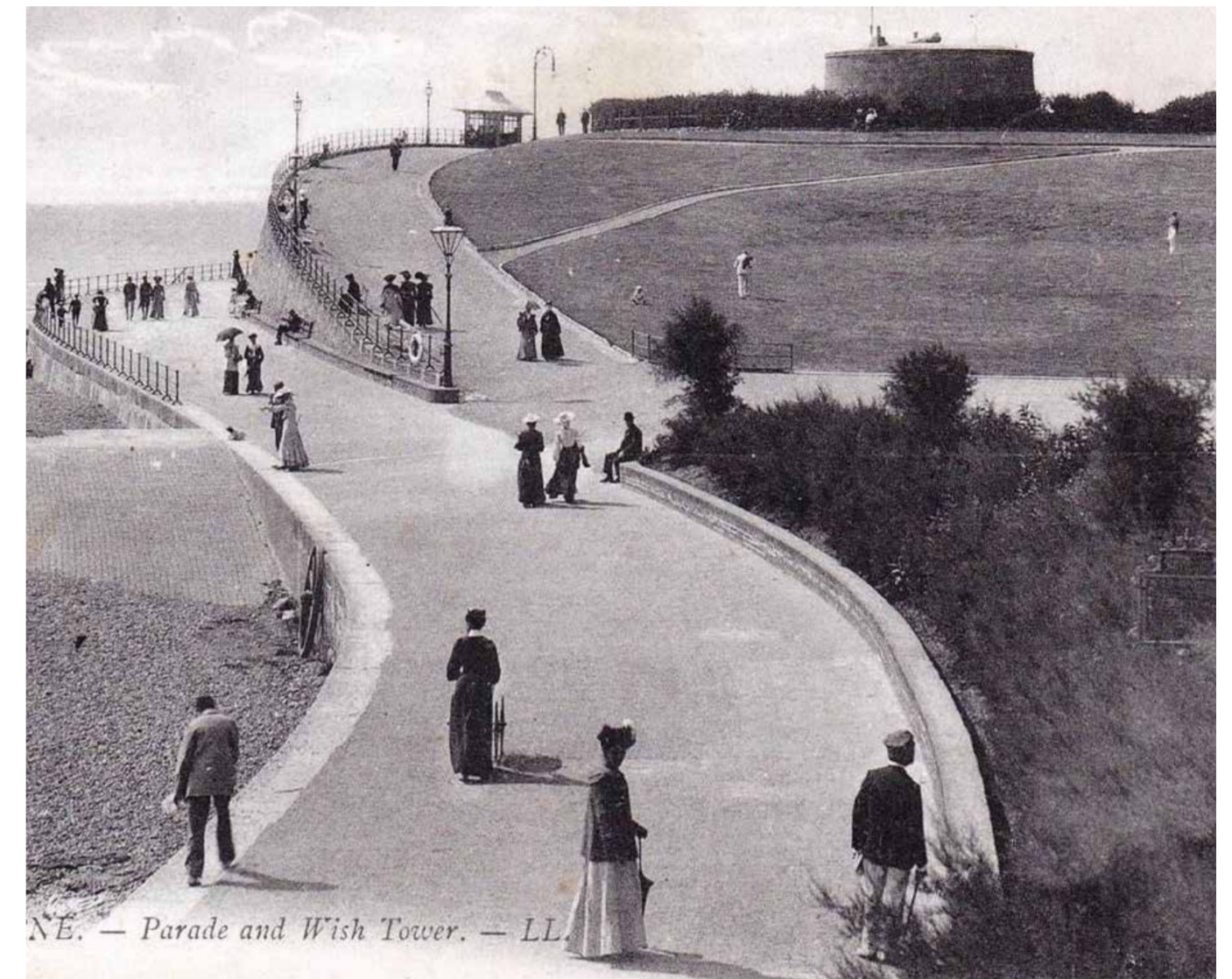
Postcard - view to the Wish Tower c1900

Shortly after this it was leased by the Eastbourne Local Board and rented to the Hollobon family who ran the tower as a geological museum until about 1930.